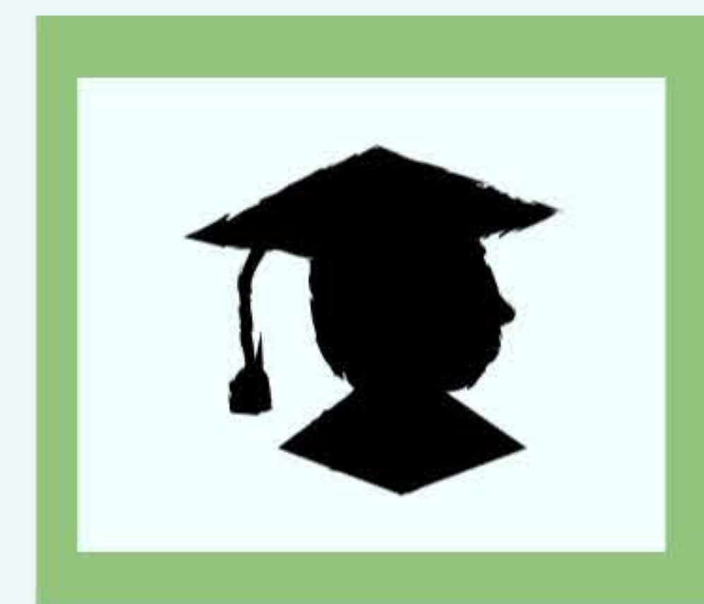
Quality of Schools

Average Life Expectancy for a baby born in New Orleans can vary by as much as