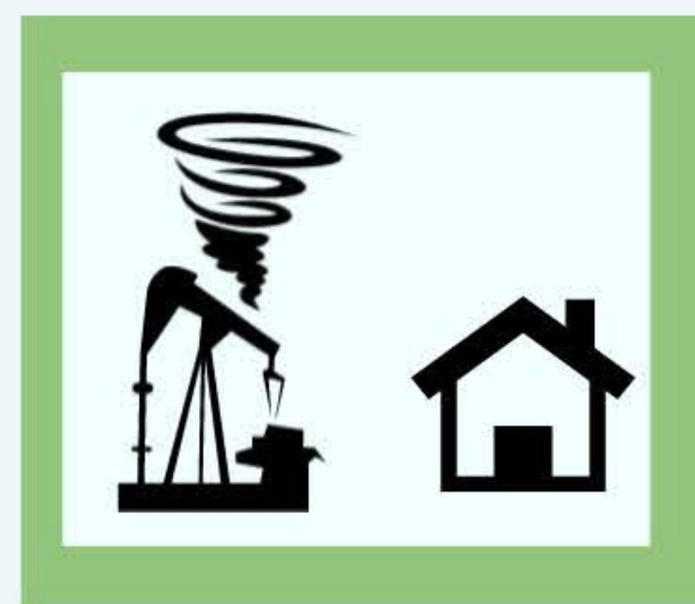
Air Pollution and Home Hazards