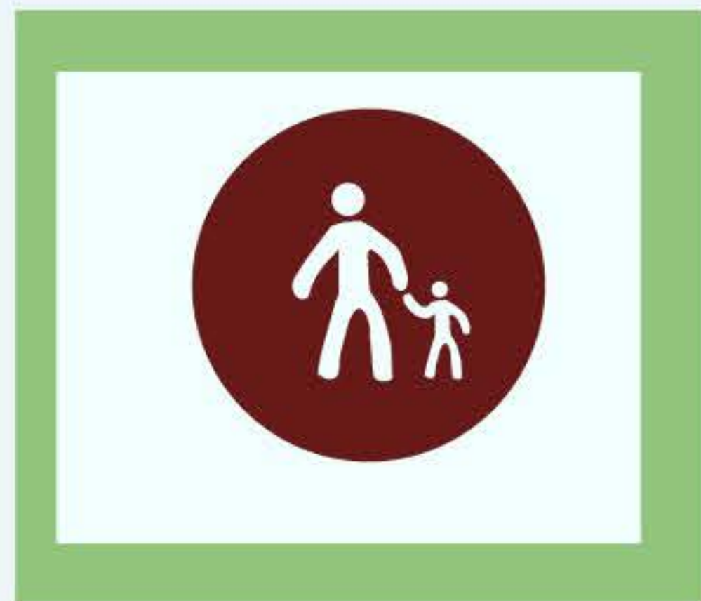
Crime and violence rates