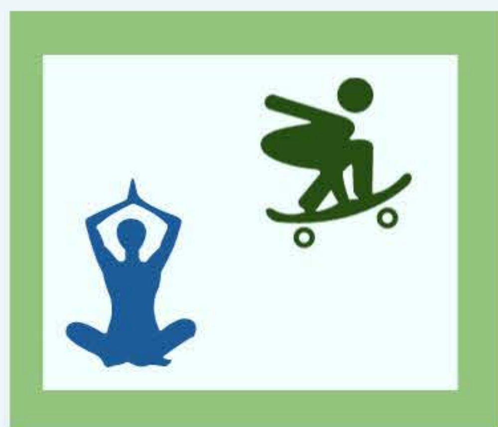
Safe Places to Exercise

How does a neighborhood affect your health?